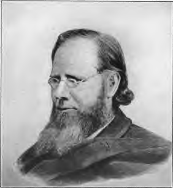
ISAAC T. HECKER